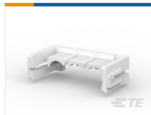
TE Part # 177919-1 POWER DBL LOCK PLATE 3P