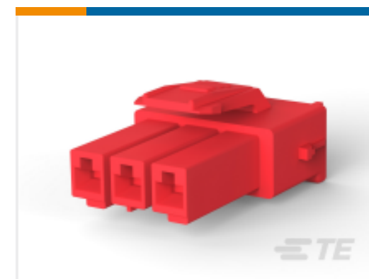
TE Part # 368571-2 PDL 3P PLUG 3.96(GWT) RED