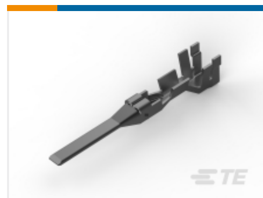
TE Part # CAT-P87024-T111 Power Double Lock Tab